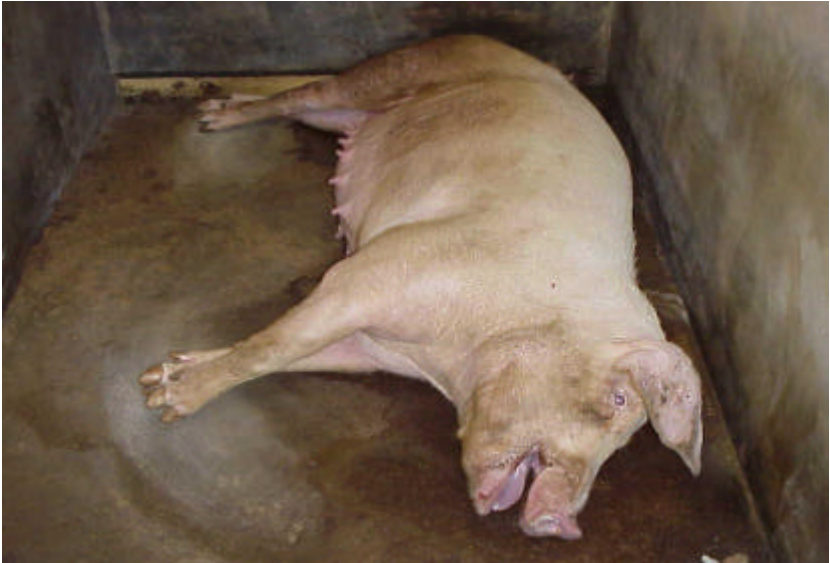
Figure 3: Acute onset neurological signs including seizures, tetanic-like spasms and jaw champing are seen in sows