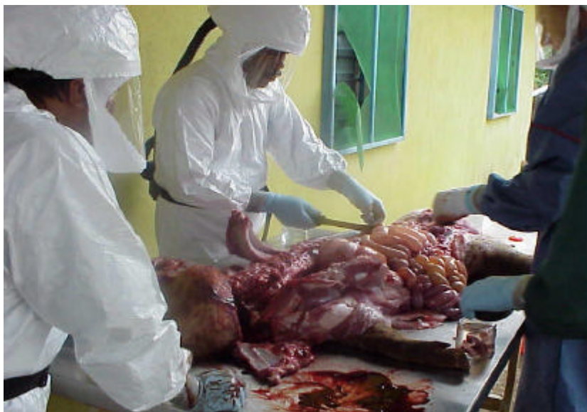
Figure 2: Protective equipment worn by those performing necropsies (note long sleeve overalls, double puncture-resistant gloves taped to overalls, and positive air pressure respirators)