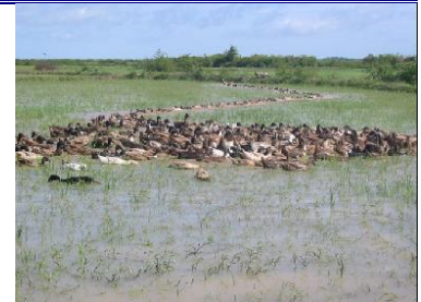
Ducks in rice field, Cambodia.

The information summarized below is gathered from official and non official sources, which are quoted in the text. AIDE news is prepared by the FAO Technical Task Force on Avian Influenza.