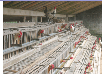
Free range cocks stand on caged birds- Poultry farming in Bangli, Bali

The information summarized below is gathered from official and non official sources, which are quoted in the text. AIDE news is prepared by the FAO Technical Task Force on Avian Influenza.